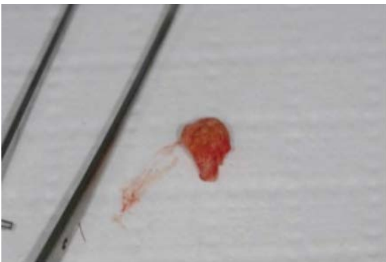
Figure 4 Sample for histological analysis.

as the formation of post-operative scars and bleeding [33] . Regarding the choice of the wavelength, in order to limit the thermal elevation and, at the same time, to obtain a good sample for histological observation [34] and to offer the patient the most comfort during the healing process, it was decided to use the blue diode laser (Ermes Blue Diode, Gardalaser, Italy, \lambda = 450 nm) with this protocol: Power 1W in CW (Continuous Wave) with an optical fiber of 320 \mu m of diameter in contact mode at a speed of around 5 mm/s (Power density 1244 W/cm 2 , Total fluence: 95790 J/cm 2 ).