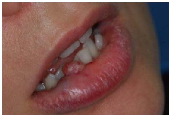
Figure 1 Clinical appearance of the lower lip lesion with aesthetical impairment.

Even if blue laser was previously proposed in den-