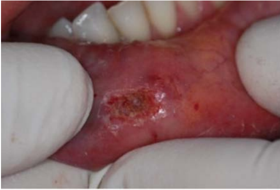
Figure 3 Image of the surgical site immediately after surgery.