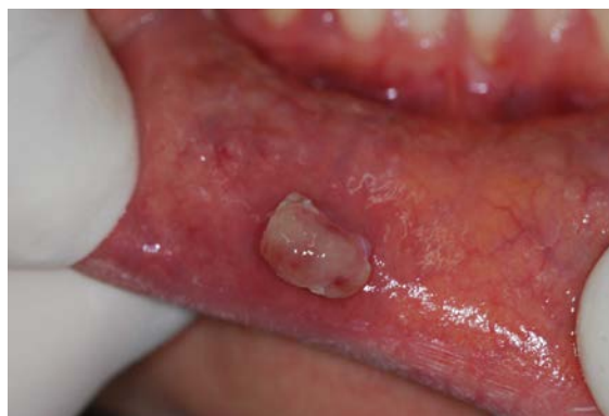
Figure 2 Lower lip fibroma probably caused by a lip biting habit.

tistry field for composite resin polymerization, while argon laser showed its efficacy, diode lasers apparently are not proposed as useful for this use [27-31] .