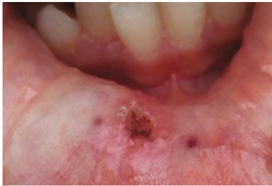
FIGURE 3: Immediate aspect after mucoccele removal: bloodless operative site, no suture was done.