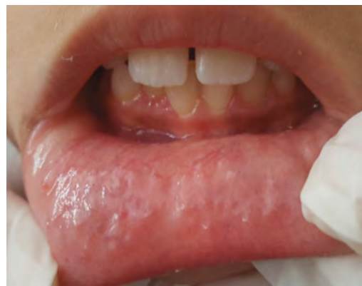
FIGURE 6: Perfect healing after 6 months of follow-up.