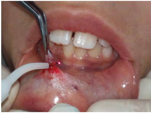
FIGURE 2: Diode laser tip handled around the lesion.