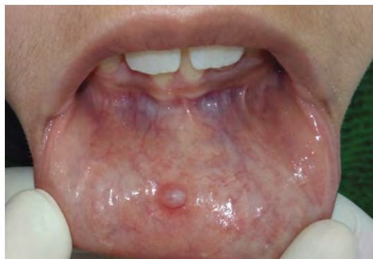
FIGURE 1: Clinical appearance of the mucocele in the lower lip.

The child was followed after 2 weeks: a fibrin network formed over the surface (Figure 5). The wound healed without complications: no postoperative discomfort or pain and no infection were noted. No recurrence was observed. The surface of the lip healed perfectly after 6 months of follow-up (Figure 6).