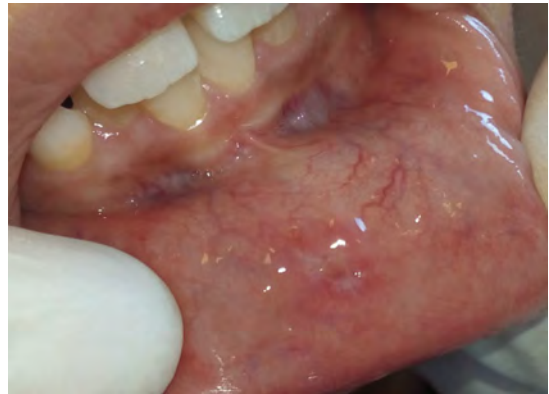
FIGURE 5: After 2 weeks of follow-up: fibrin network recovered the site.